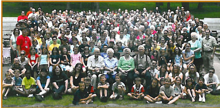
Cadence family at the worldwide conference at Green Lake